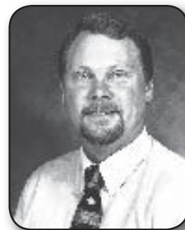
Paul Brown Event Management