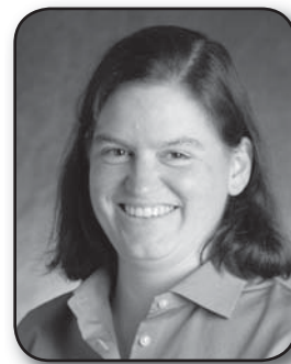
Amy Hughes Sports Information